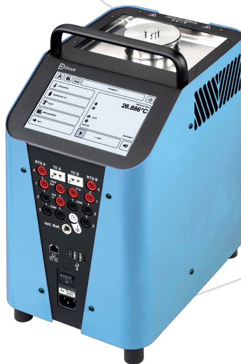
PTC165i Integrated measuring instrument