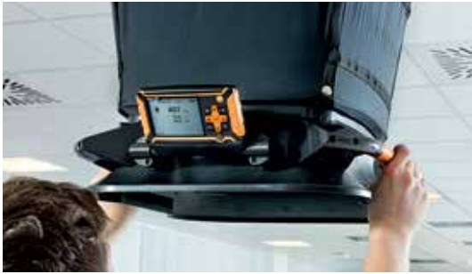
Low weight and tilting display.