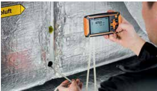
Functional principle of the flow straightener.